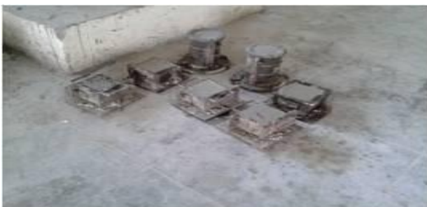
Fig 7 Casting of Specimens

The concrete after workability was used for casting the casting of concrete is by using steel moulds. Cube, Cylinder, Prism moulds are used for casting concrete. Cube moulds of size 150x150x150mm. Cylinder moulds of size 150x300mm. Prism moulds 100x100x500mm were used. The concrete was filled in three layers. Each layer was compacted with standard tamping rod.