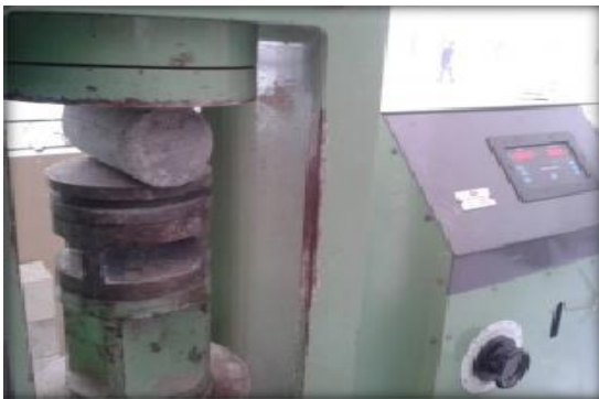
Fig 10 Split tensile Strength Test on Concrete Cylinders(UTM)