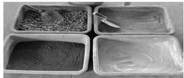
Fig 1 Collection of Materials

Fine Aggregate, Coarse Aggregate (20mm), Water, Cement (OPC 53 grade), Silica fume, Fly ash, Recycled coarse aggregate (20mm), Super Plastizer.