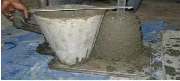
Fig 5 Slump Cone Test