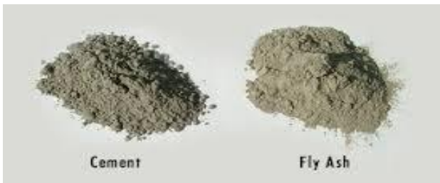
Fig 4 Fly Ash

The ash produced at thermal power stations by burning of coal and lignite is known as fly ash. Fly ash is a pozzolonic material which behaves like cement in presence of lime/cement and water. It improves workability. Prevent the concrete from acids and alkali silica reaction. Resistance to freezing & thawing.