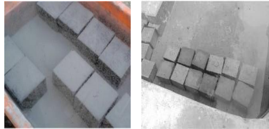
Fig 8 Curing of Specimens

After 24 hrs the specimens are immersed in to water for initial curing. The specimens are removed from the mould after 24 hrs and cured in water for 14& 28 days.