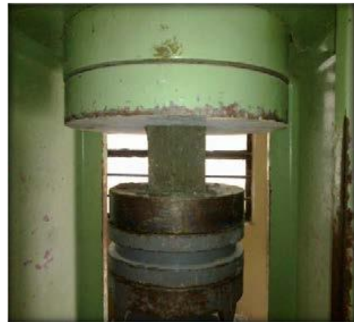
Fig 9 Compression Test on Concrete