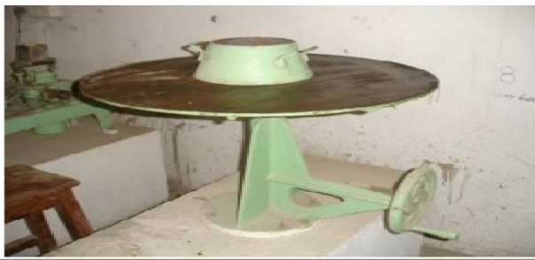
Fig 6 Flow Table Test