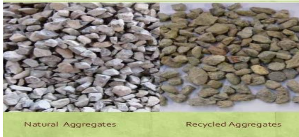
Fig 2 Recycled Coarse Aggregate

collected from demolished buildings, roads, bridges etc. Recycled aggregate is comprised of crushed, graded inorganic particles processed from the materials that have been used in the construction & demolition debris.